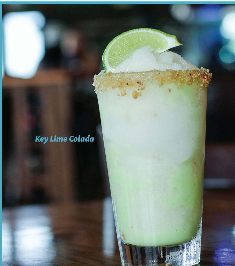
Key Lime Colada

A blend of Strawberry Daiquiri & Piña Colada.